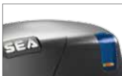
Led light application on all models possible (optional)