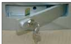
Release system through robust nylon lever and metal lock